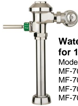
Water Closet Flushometer for 1½" Top Spud Models MF-700-T11 (HET) MF-700-T12 (HET) MF-700-DFT (HET) MF-700-T16 (LC)